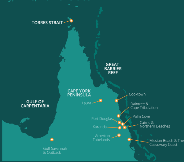
Fly, Drive, Train or Cruise

Tropical North Queensland is a deceptively vast region so planning the ultimate fishing holiday takes some consideration. If you don't have your own boat, flying into Cairns is often the best option regardless of where your fishing adventure takes you.